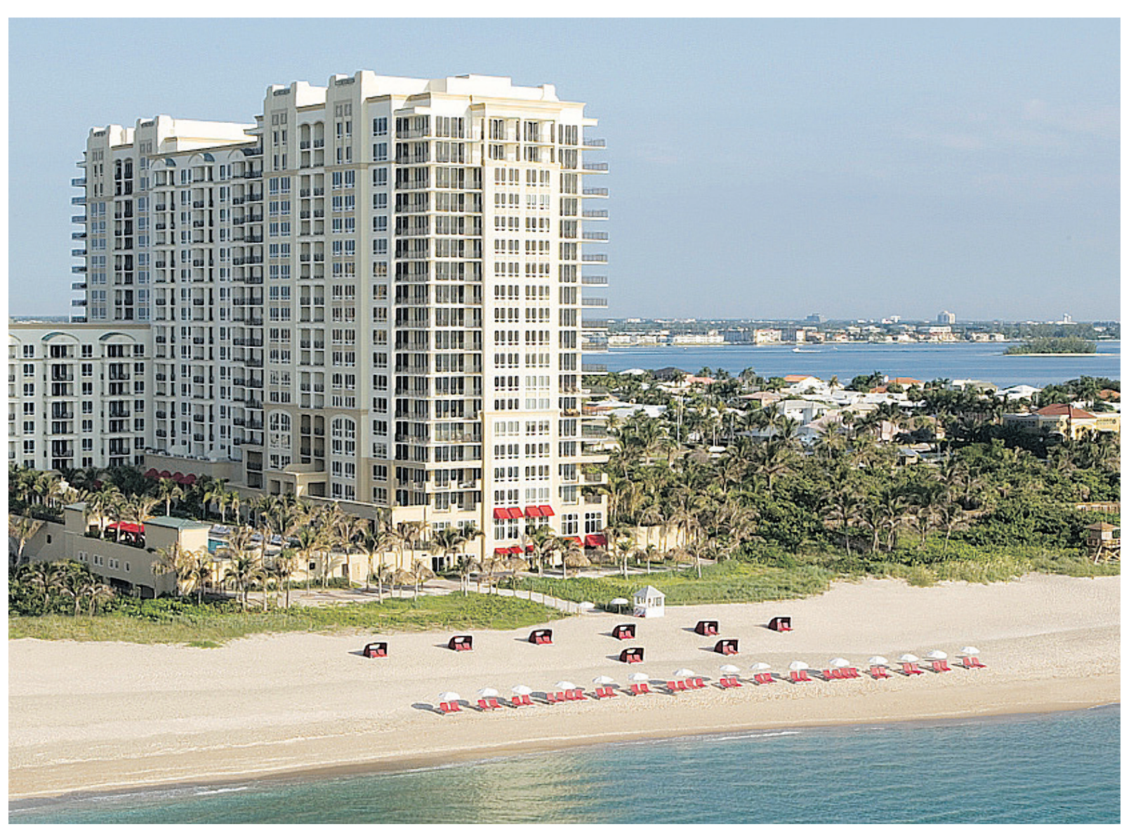
The Marriott Singer Island Resort offers outstanding beach life.